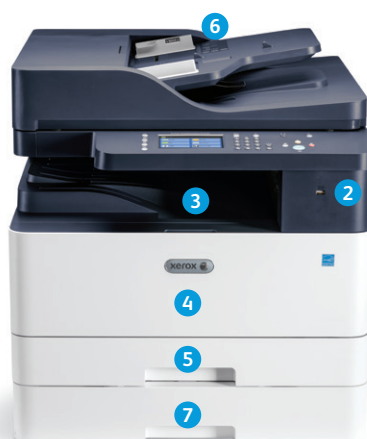
Xerox® B1025 Multifunction Printer

DADF configuration shown with optional additional tray.