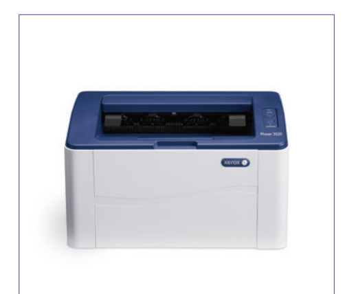
Phaser 3020. Print.