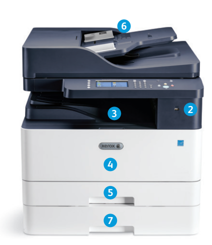
Xerox® B1025 Multifunction Printer DADF configuration shown with optional additional tray.