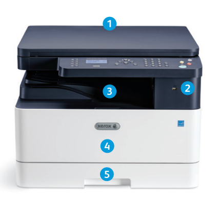
Xerox® B1022 Multifunction Printer